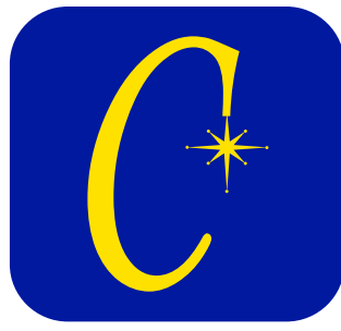
Cimazing App Icon